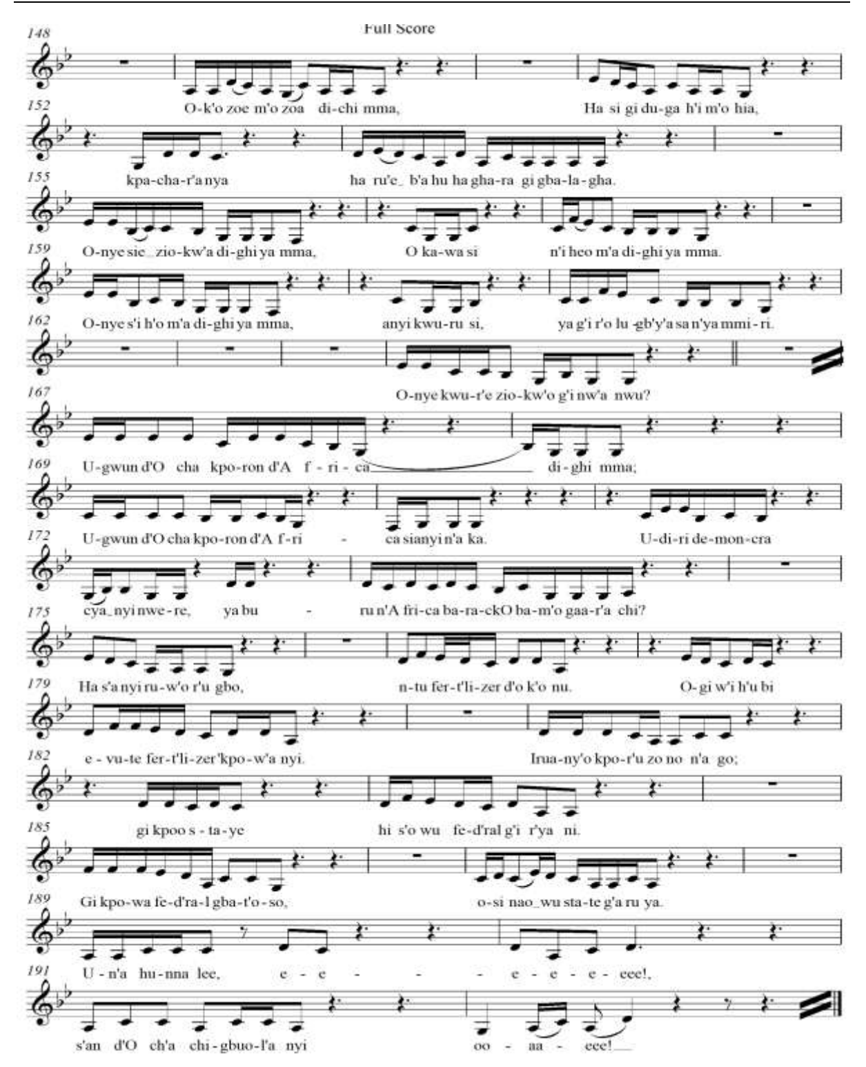
Concomitant Paraphernalia of Innovations and Continuity in Abigbo Mbaise Musical Convent..